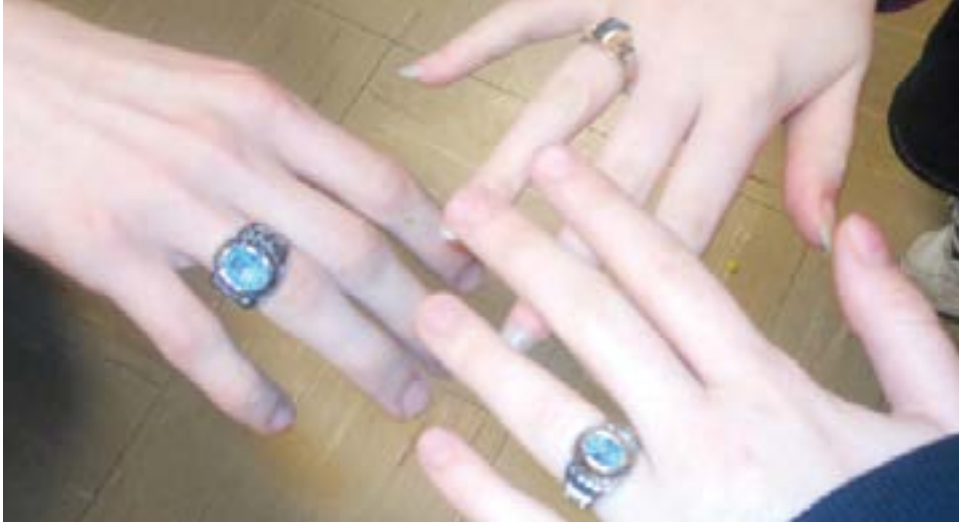
Juniors gladly showed off their new class rings.

adults, but it was enough to fill the Wright Place."