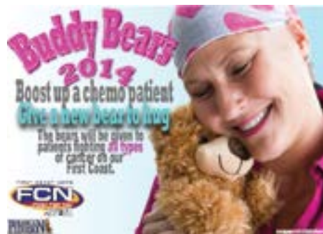
Poster design by Jeremy Pizarro

Peterson started participating in buddy bears to encourage other schools to also inspire all of Jacksonville to participate. There is no size limit or limit on the amount of teddy bears.