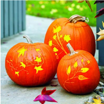
Amy & Cecilia

Mobile app! https://dcps.duvalschools.org/Page/20731