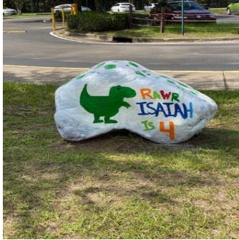
Happy 4 th Birthday! Isaiah