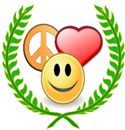
Amy & Cecilia

Mobile app! https://dcps.duvalschools.org/Page/20731