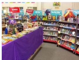
Axson Book Fair

Thank you for donating change at the book fair, we were able buy 35 books with the change alone! Thank you for your generosity!