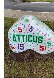
Happy 5th Birthday! Atticus