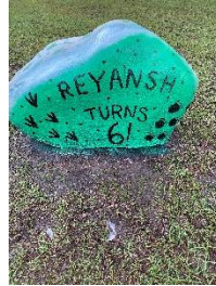
Happy 6th Birthday! Reyansh