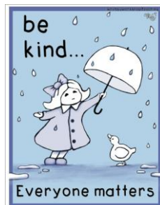
Amy & Cecilia