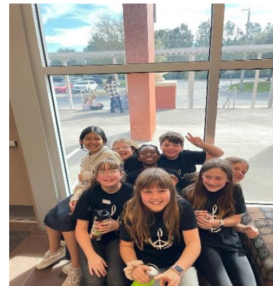
Axson Robo Rockers and Rising Robo Rockers off to Regionals!!